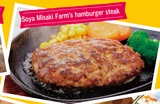
Soya Misaki Farm's hamburger steak