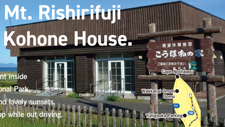
展望休憩施設 ころほねの家 ご自由にお休み下さい Rishiri Cape Noshappu

This is a gorgeous outlook point inside Rishiri-Rebun-Sarobetsu National Park, with a view of Rishiri Island and lovely sunsets. It's a great place for a rest stop while out driving.