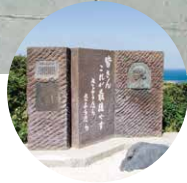
The 9 Maidens Monument