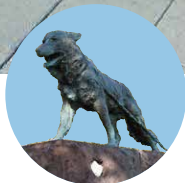
Antarctic Exploration Sakhalin Husky-Training Memorial Monument