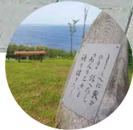
Tanka no Michi Poetry Path