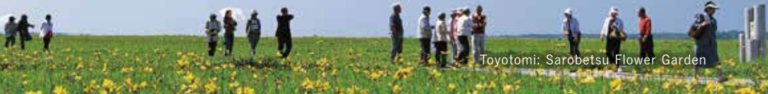
Toyotomi: Sarobetsu Flower Garden

This was designated the northernmost national park in Japan in 1974, and covers the one city and five towns of Wakkanai, Rishiri, Rishiri Fuji, Rebun, Toyotomi, and Horonobe. Come see, eat, and try new things to enjoy nature with all five senses on your trip through the area.