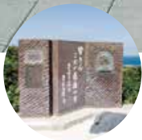
The 9 Maidens Monument