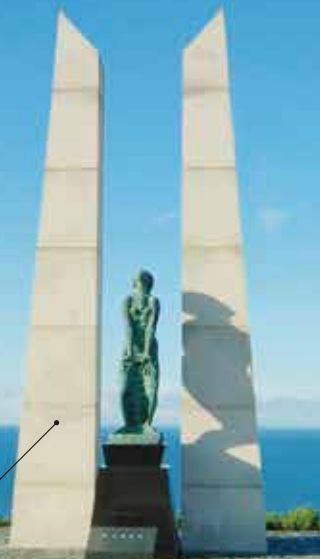
The "Hyosetsu Gate" cenotaph to the Karafuto islanders

This park, set on a high plateau, offers not only a lovely ocean view but also hosts Hyosetsu Gate and the 9 Maidens Monument by sculptor Shin Hongo, a monument to the Sakhalin Huskies who helped in Antarctic exploration, and the Tanka no Michi. Get closer to history in national border-town Wakkanai.