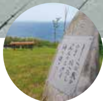
Tanka no Michi Poetry Path