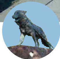
Antarctic Exploration Sakhalin Husky-Training Memorial Monument